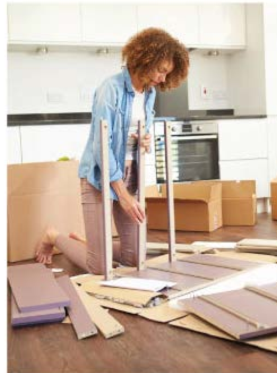
Financial factors influence Ikea furniture design

Financial factors refer to budget constraints within the project, but also in intended sale price of the product, service or building. In both of these cases, the designer must consider the cost of the design as well as the cost of production.