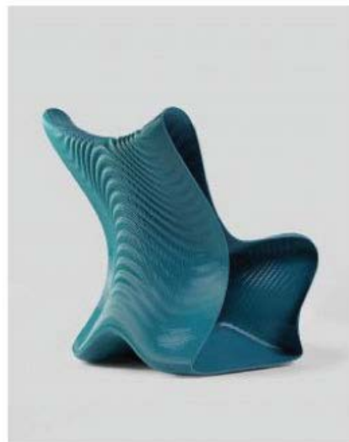
Some objects are designed to showcase advancements in technology