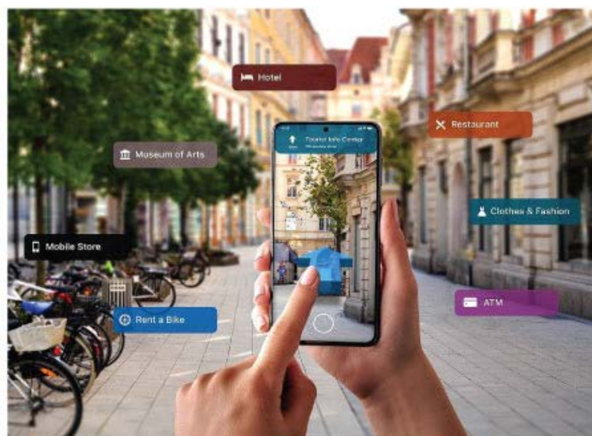
Technology is drawn on to improve interactive design